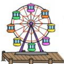
pier and wheel